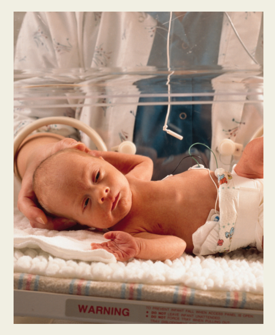
Smoking during pregnancy can cause your baby to be born too early and have low birth weight. If you smoke, your baby is more likely to become sick or die.

• Even a few seconds of breathing secondhand smoke can trigger a severe asthma attack for your child. Researchers estimate that living in homes with secondhand smoke causes 28,000 children to be hospitalized for asthma each year. Some of these children die.