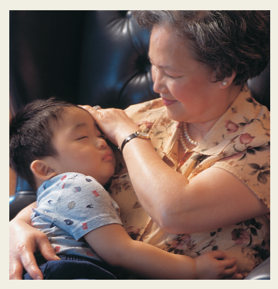
As adults, we have the power to protect our children from the dangers of secondhand smoke.